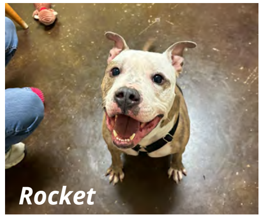
Blue and Rocket were constantly overlooked. You supported these underdogs until they found their forever family!

magine walking into the SPCA Cincinnati and there, among the eager faces, you spot a pair of eyes. They've seen so many people and animals come and go. They still hold onto hope that someone will choose them soon, but they've waited so long for their turn. All they want is to be seen, chosen, and loved.